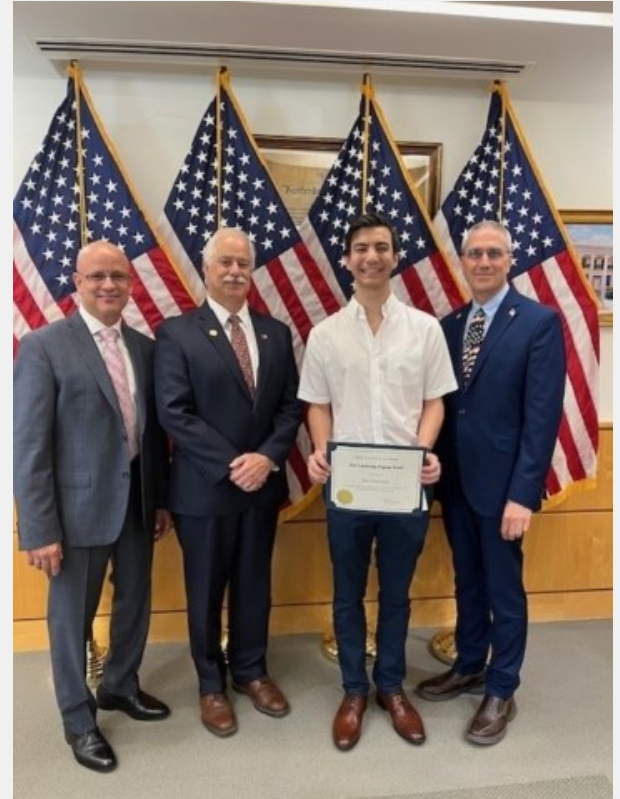
Hunterdon County Scholarship Recipient