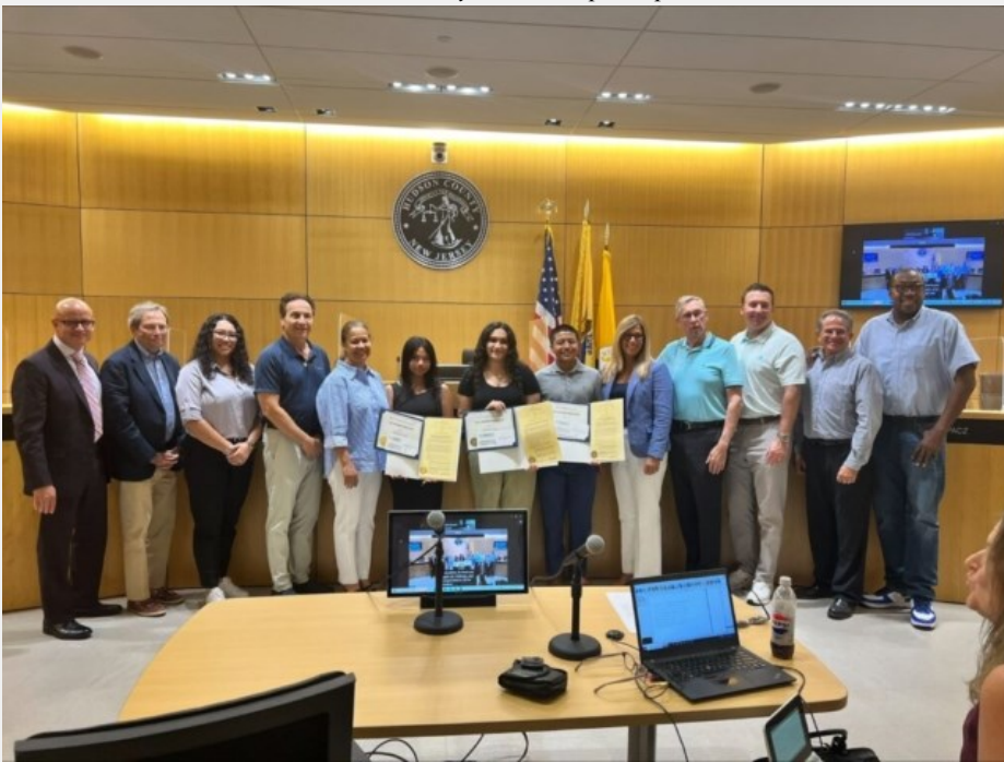
Hudson County Scholarship Recipients