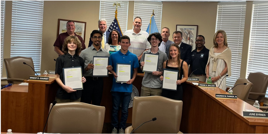
Atlantic County Scholarship Recipients