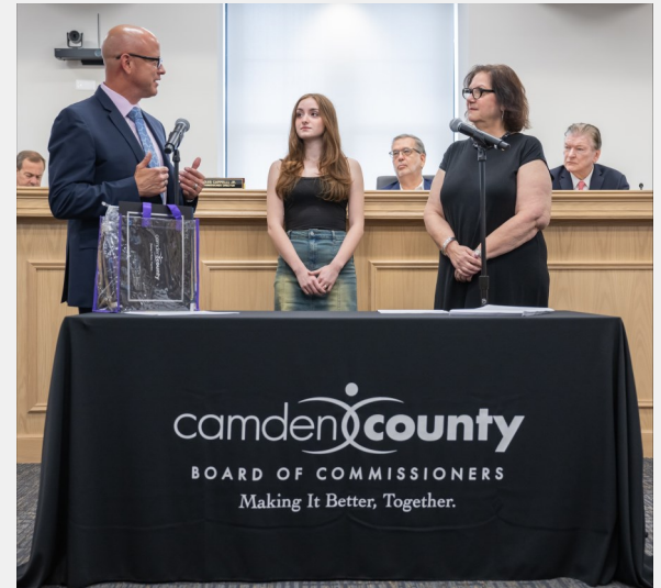
Camden County Scholarship Recipient