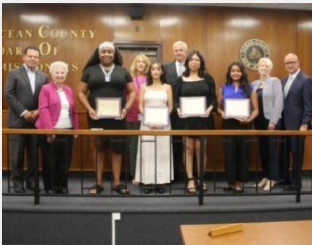
Ocean County Scholarship Recipients