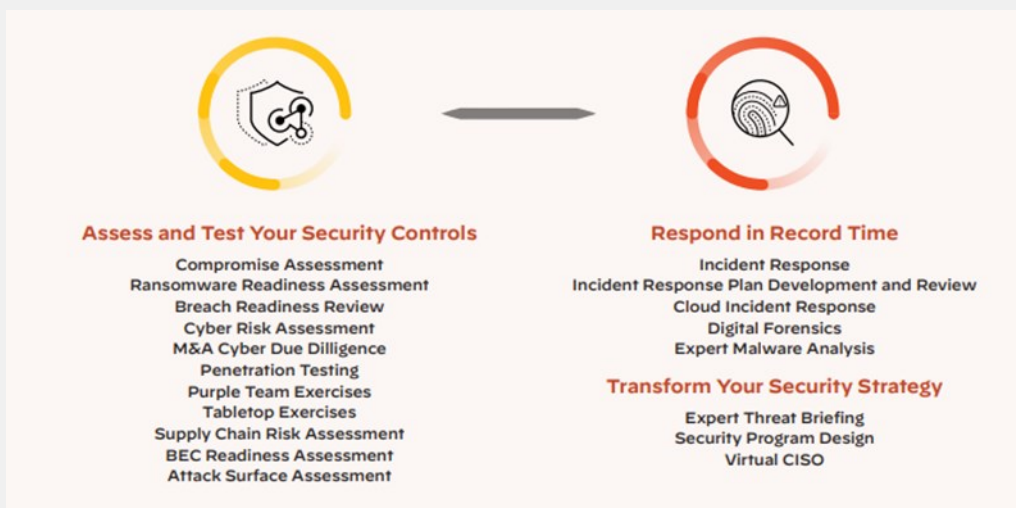
Figure 1: Unit 42 Cyber Risk Management and Incident Response Services

When your organization faces a severe cyber incident, will you be ready? The speed of your response, as well as the effectiveness of your tools and playbooks, will determine how quickly you can recover. Extend the capabilities of your team by putting the world-class Unit 42 Incident Response and Cyber Risk Management teams on speed dial. Incident Response Expertise Is Just the Beginning From cases involving rogue insiders to organized crime syndicates and nation-state threats, Unit 42 performs more than 1,000 incident response investigations each year. The Unit 42 Retainer gives you deep forensics and response expertise when you need it most, with predetermined service-level agreements (SLAs). You can also allocate your retainer credits for proactive Unit 42 cyber risk management services scoped during the contract term. Our trusted advisors can assist your team with security strategy, assessment of technical controls, and overall program maturity. Use retainer credits for any of the services in figure 1.