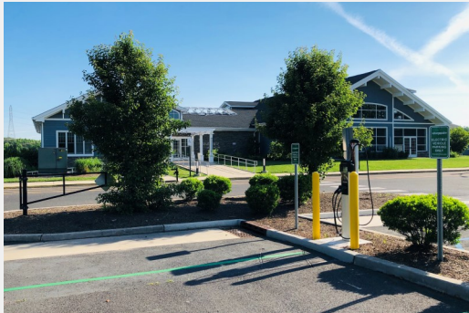
A dual-port electric vehicle charger outside The Boathouse at Mercer Lake in Mercer County Park, West Windsor.