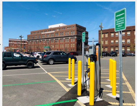
A dual-port electric vehicle charger outside the Mercer County Administration Building in Trenton.

Drivers of all types of vehicles are reminded that EV charging spots are for charging, not parking. Visit ChargePoint’s website for tips on EV etiquette . For additional information on charging electric vehicles, visit the “Drive Green” section of the NJDEP website.