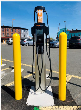
One of the dual-port electric vehicle chargers that have been installed at 11 Mercer County-owned facilities.