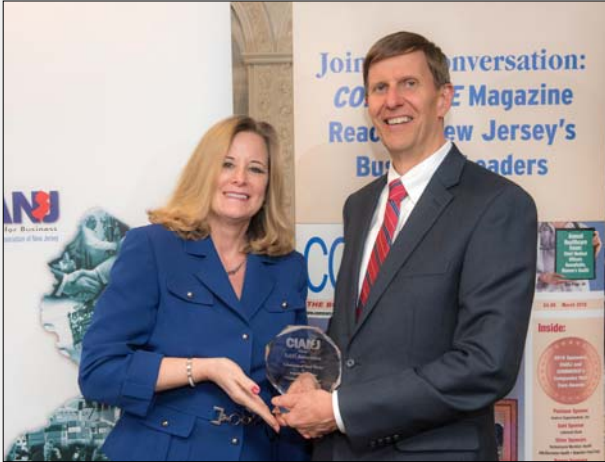
L. to R: