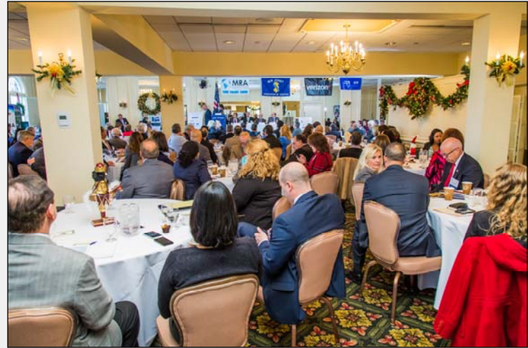
County and business leaders focused on the remarks of the Health Benefits panelists