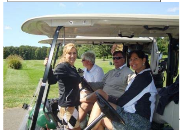
Investors Bank Golfers