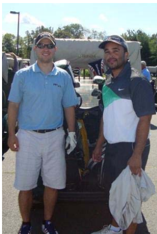
ProAct, Inc. Golfers

During the dinner reception golfers with winning tickets picked up their door prizes donated by Bradford Renaissance Portraits, Caesar’s Entertainment, IZOD Center, Lakewood Blue Claws/JCP&L, Mercer County Park Commission, New Jersey Devils, Somerset County Park Commission, Somerset Patriots Baseball Club, Sun National Bank Center, Trent Thunder, and Union County.