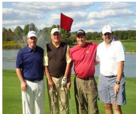
CorVel Corporation First Place Winners