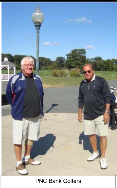
PNC Bank Golfers