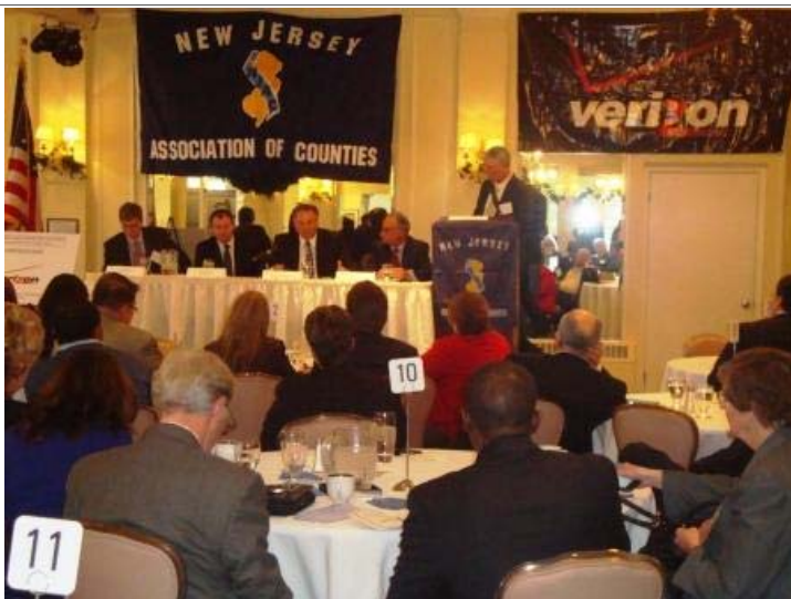
Moderator and Panelists of Utility Leaders